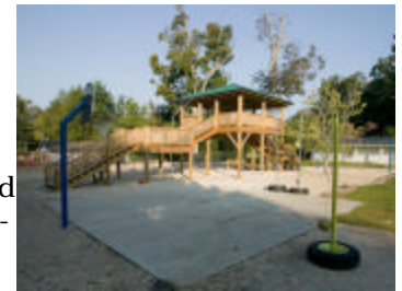
New 1 st -6 th Treehouse